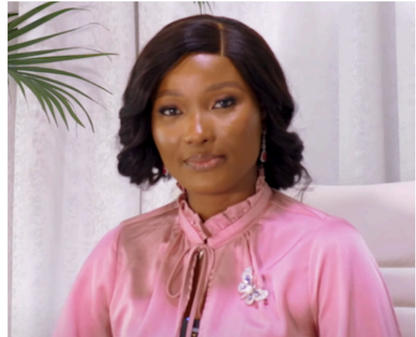
Purpose and Etiquette: The Connection

Purposeful living is not just about personal success; it is about creating a refined and dignified society. At Etiquette Africa Initiative and Etiquette With Eti Academy, we believe that human social capital development plays a crucial role in shaping individuals who will contribute positively to their communities. By embracing proper etiquette, self-discipline, and respect for others, we cultivate an environment where purposeful living thrives.